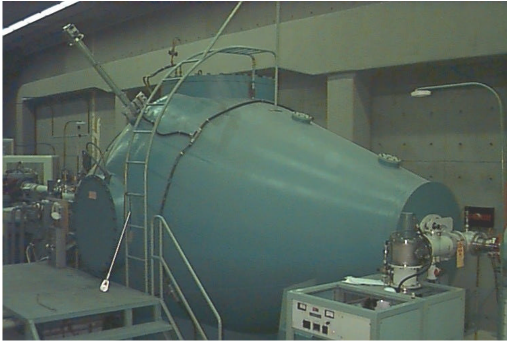
Demokritos TANDEM accelerator