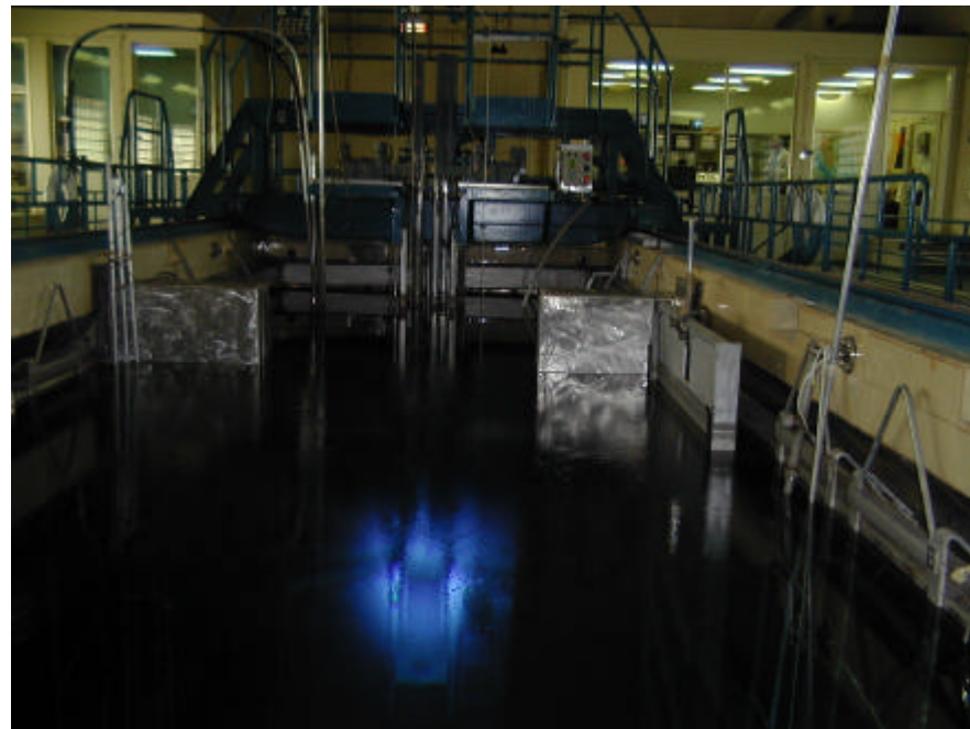
The Nuclear Reactor